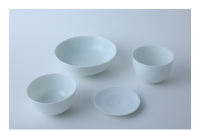
Image15: "Four Bowls" Akio Niisato