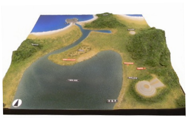
Image1: Takano-gata - lagoon and tumulus, 5th Century

Since ancient times, cinnabar has been mined in Kyotango and painted on ancient burial mounds and earthenware. In this region, textile was dyed with Akane (Japanese madder) in vermillion. Vermillion used to have the meaning of talisman against evil because it reminded us of the sun and blood and, Japanese flag is dyed in madder. For the special exhibition "ECHO TOMORROW FIELD – Food and Art," contemporary artists will create and presents crafts, designs and artworks Inspired by vermillion in Tango.