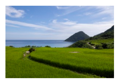
Image16: Sodeshi Rice Terraces