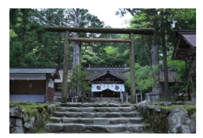
Image17: Moto Ise Naiku Kotai Shrine, Fukuchiyama