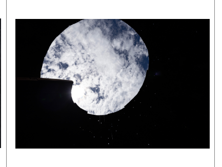
"Field of Stars", 2023