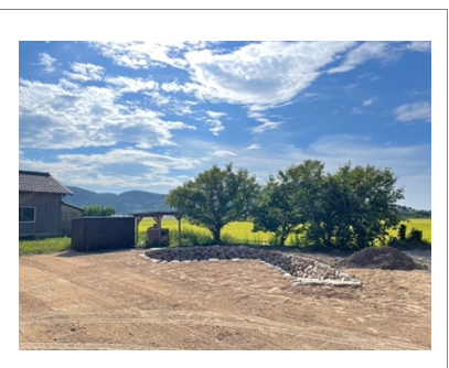
Production view of "Field of Stars"