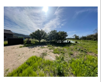
Production view of "Field of Stars"