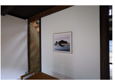
Naoya Hatakeyama "Taiza, Tango 2023" 2023