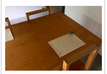
Natsuki Ikezawa "Taiza, Tango 2023" 2023