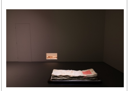
AAWAA "Ni" 2023