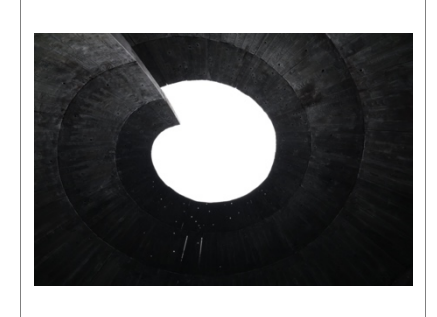
"Field of Stars" 2023