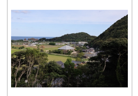
Scenery of Miya district, Tango from Shinmeiyama Tumulus, 2023