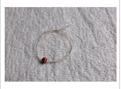
Yoshihisa Tanaka (hemp paper), Akio Niisato (porcelain) "Hemp Paper Charm" 2023

*Credit line for all images above (except No. 28)