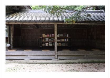
Yoshitaka Haba "Book of Paper" 2023