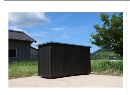
Ryue Nishizawa "Store House" 2022