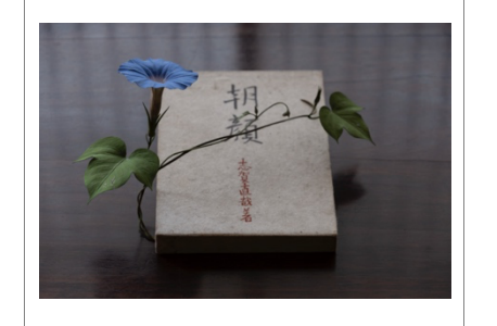
Yoshihiro Suda "Morning Glory" 2022