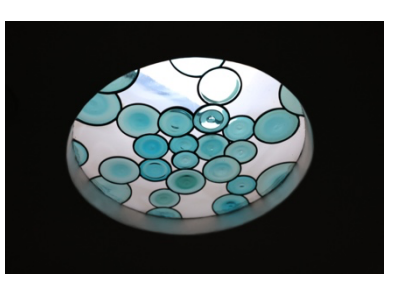
Satoshi Sato (Glass) "Nature Room" 2023