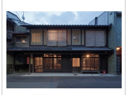
"⊞ | SEI" facade