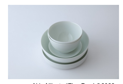
Akio Niisato "Five Bowls" 2023