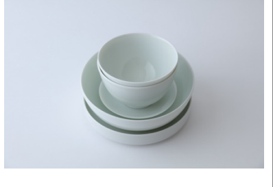
Akio Niisato "Five Bowls" 2023