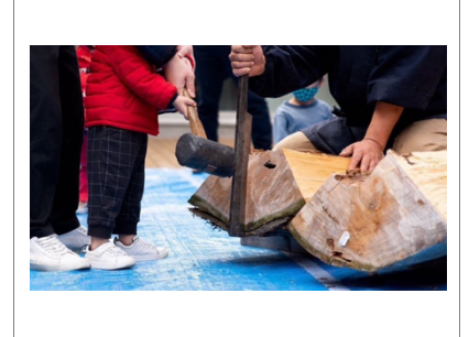
Shuji Nakagawa (Nakagawa Mokkougei) "TOMORROW Workshop"