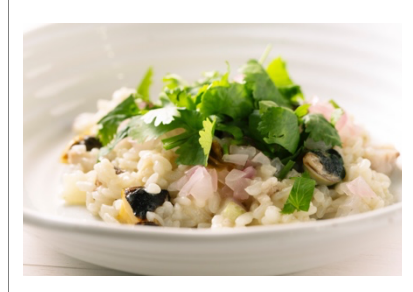
Ken Sakamoto (cenci) "Restaurant for those who live in the present – Fresh seafood and chive risotto"