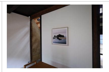
Taiza, Tango 2023

composition of a poems by Natsuki Ikezawa and a photographic work by Naoya Hatakeyama.