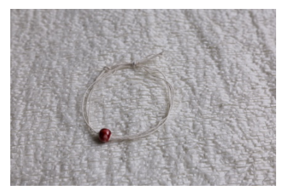
Yoshihisa Tanaka (hemp paper) Akio Niisato (porcelain) "Hemp paper charm" 2023