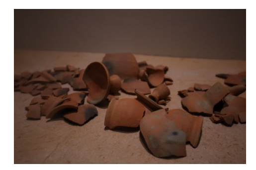
Installation view of "Ni"

Title: Ni Artist: AAWAA Year: 2023 Material: Silk cloth buried in mud with red clay in Tango, field-fired earthenware made of red clay in Tango, photographs