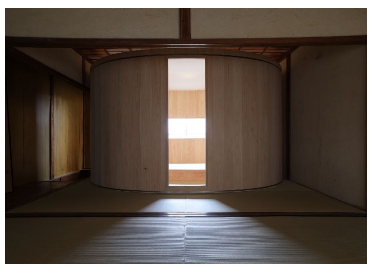
Shuji Nakagawa "Wooden Room", 2022