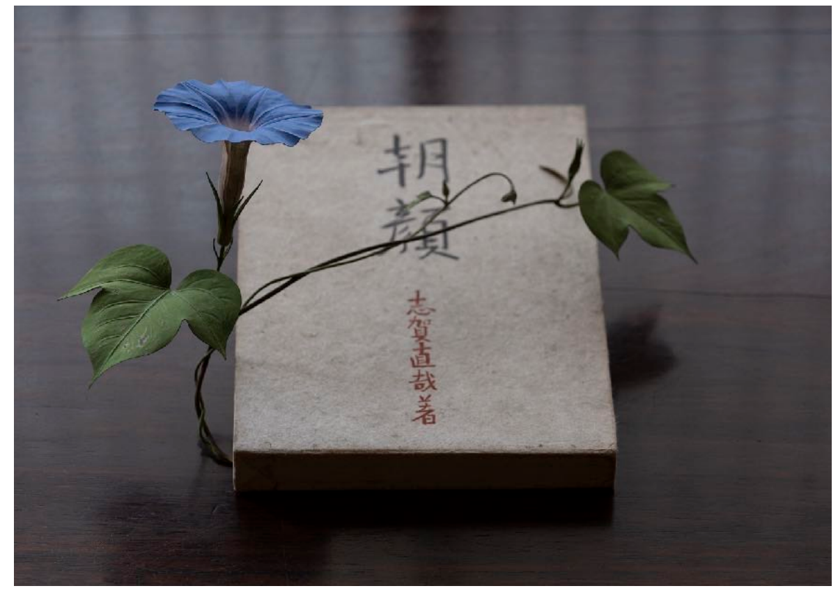
Yoshihiro Suda "Morning Glory", 2022