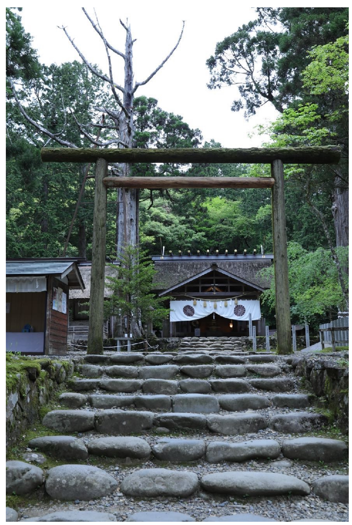
Motoise Imperial Shrine