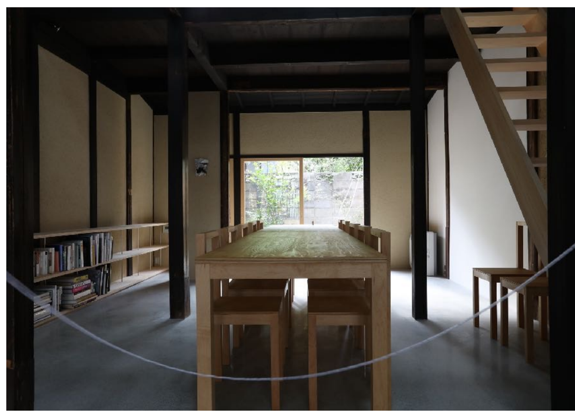
⊞ ∣ SEI (Kyoto City)